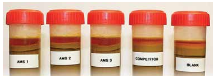
AMulSion COD Demulsifiers